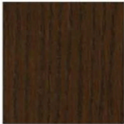
Rift Walnut Dark